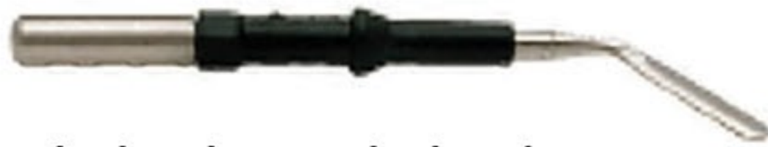
Blade Electrode (Crv) Reusable MT-20-002