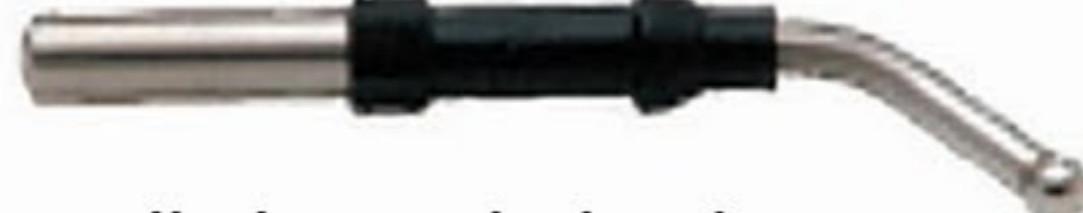
Ball Electrode (Crv) 3mm Reusable MT-20-008