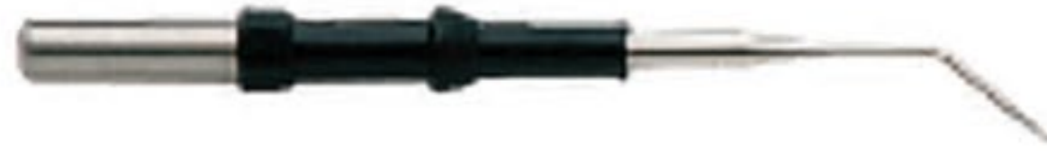
Ball Electrode (Crv.) (4.0 Mm) Reusable MT-20-004