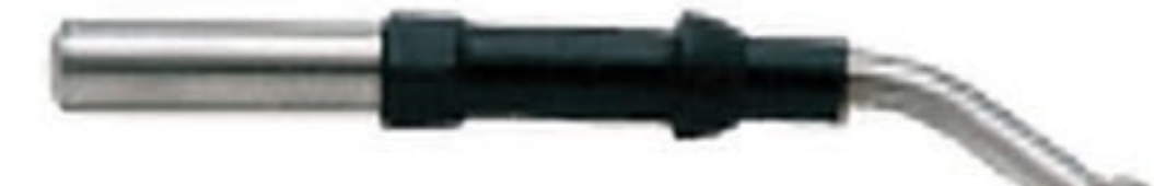
Ball Electrode (Crv) (4mm) Reusable MT-20-010