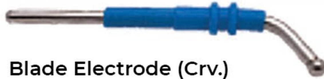
Blade Electrode (Crv.) Disposable MT-03-002