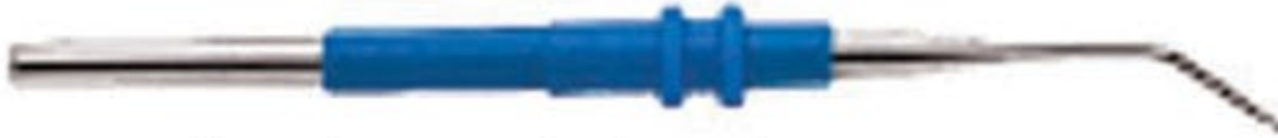
Needle Electrode (Crv.) Disposable MT-03-004