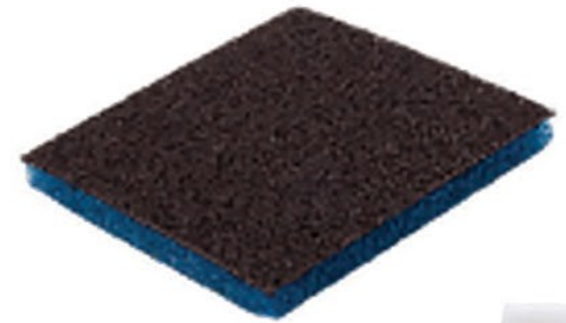
Tip Cleaner MT-03-35