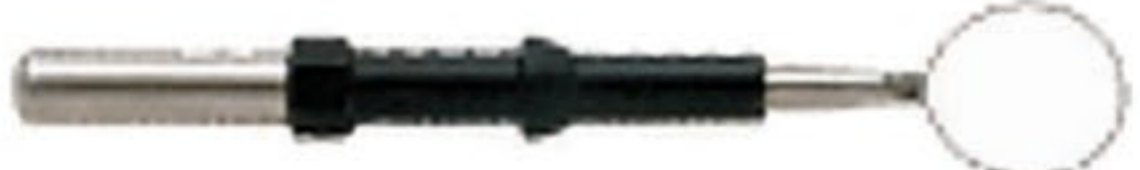
Round Loop Electrode (7.0cm) 10.0mm Reusable MT-20-016