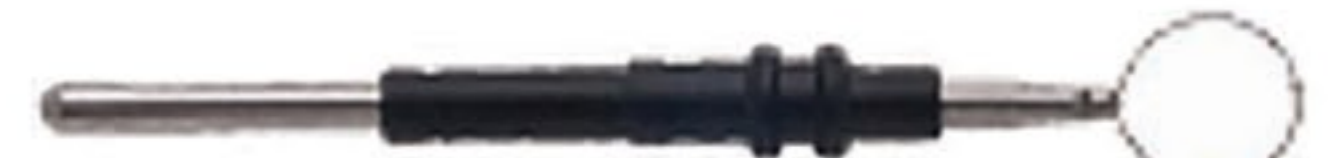
Circle Loop Electrode 8.0 Mm Reusable MT-04-003